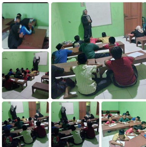
Figure 2. Writing and Teaching Process

First, writing stage. The students are given notes of the names of Asmaul Husna in stages, namely 10 only; and then after being written, the students will be directed to read by following the accompanying Ustadzah . After the students have mastered the first 10 lessons, the students will be given the next lesson, namely by writing the next 10 Asmaul Husna in the 2nd stage. And so on until the final stage. The reason why the names of Asmaul Husna must be written is so that the students can study them outside of study hours with their Ustadzah at the al-Qur'an Education Park, so when at home or studying with friends they can study them themselves. In addition, these notes can one day be taught by the students to family or relatives in the future.