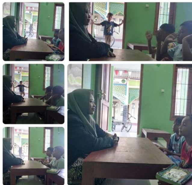
Figure 4. Murajaah Process

After everyone is sure that they have memorized it, they can submit it to their Ustadzah , 3 or 5 children come forward to memorize Asmaul Husna along with the meaning and movements together with their friends in a compact manner in front of their Ustadzah until the Ustadzah declares them to have passed. After going through the method process from stage 1 to the next stage in memorizing the students until the final stage, it is expected that the students will really memorize Asmaul Husna along with the meaning and movements so that the students can sing while interpreting it so that when memorizing or mentioning one of Asmaul Husna while mentioning its meaning, the students can understand and interpret the meaning of the Asma Allah and believe in it and can apply it in everyday life later when the students are adults. Because the learning that children receive from an early age will continue to stick and God willing will be embedded in the hearts and minds as a foundation, so that until adulthood the knowledge will not be forgotten and with istiqomah the children can apply it in their future lives until the end of their lives.