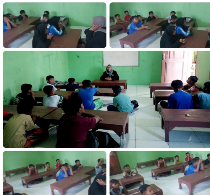
Figure 3. Memorization Process

can do it independently. To prove that the students really can, a random test will be held to sing it themselves so that we are sure that the students can memorize it properly. After the students have mastered the first 10 Asmaul Husna , we will add the next 10 Asmaul Husna . For lower classes, if memorizing the 10 names of Asmaul Husna feels burdensome, it should be reduced to 5, with the aim that the lower class students do not mind and can follow happily and smoothly until the final result is being able to memorize from stage 1 to the next stage which is continuous so that it can reach 99 Asmaul Husna . The method of memorizing by singing will be very easy for male and female students, because the method is very enjoyable and with a happy heart so that without realizing it the child can memorize up to 99.